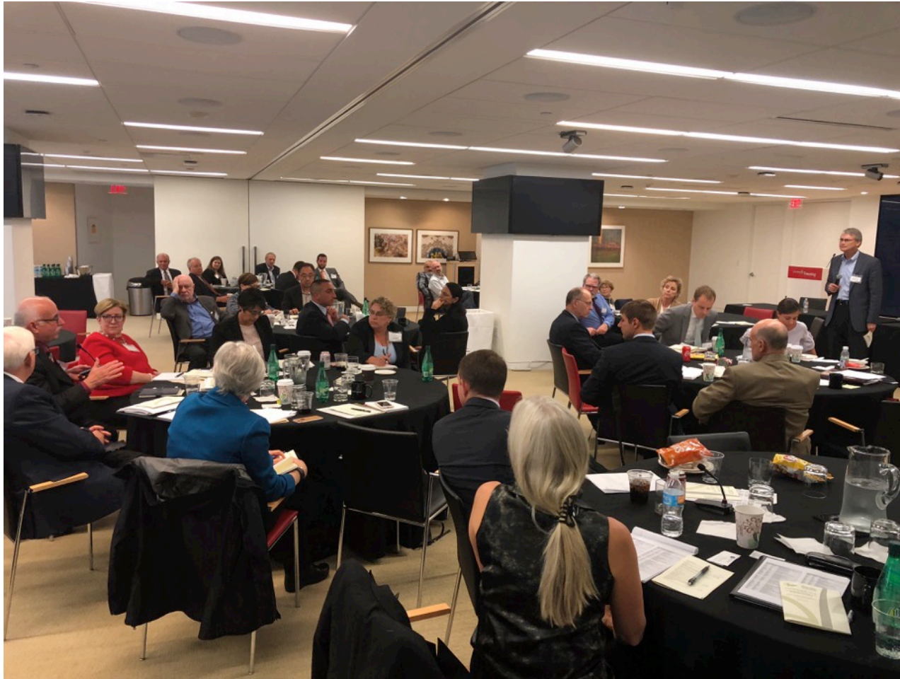
Audience engages during Plenary Session