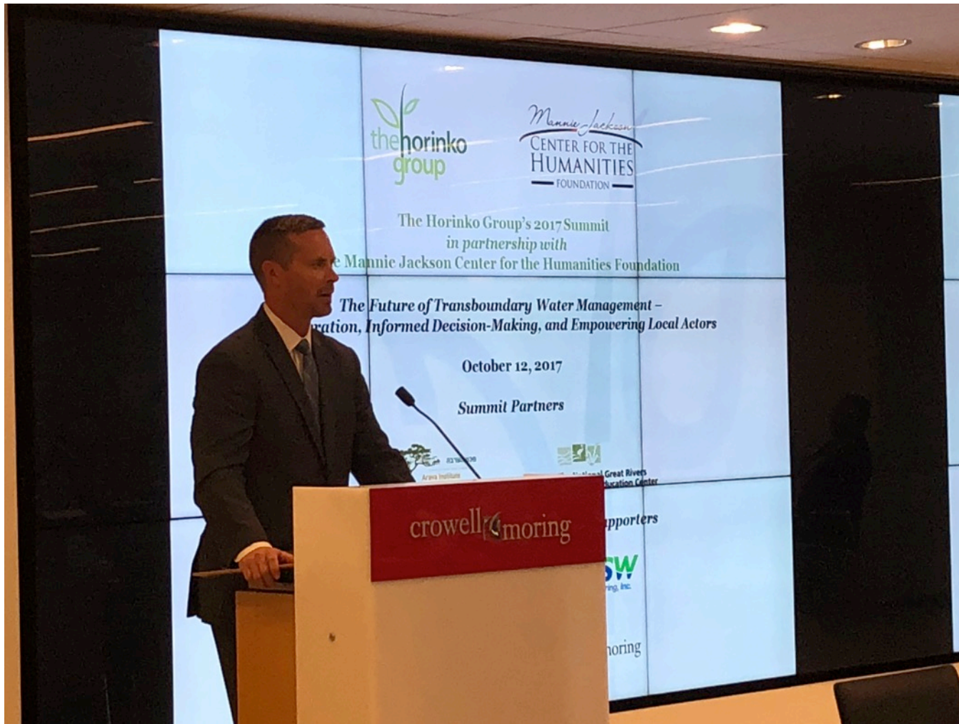
U. S. Congressman Rodney Davis, Representative in Congress for the 13th Congressional District of Illinois provides Kick Off Remarks