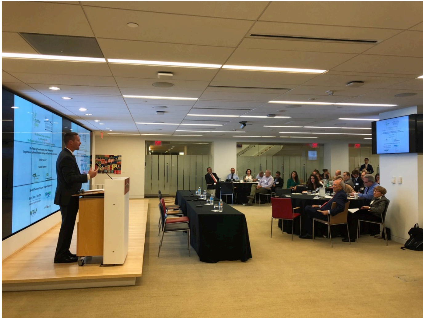
U. S. Congressman Rodney Davis provides Kick Off Remarks